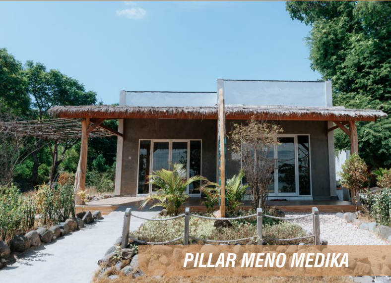
PILLAR MENO MEDIKA

THE MEDICAL CENTER FACILITY THAT WE HAVE IN GILI MENO IS CALLED THE PILLAR MENO MEDIKA