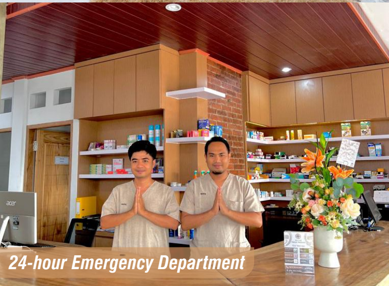
24-hour Emergency Department