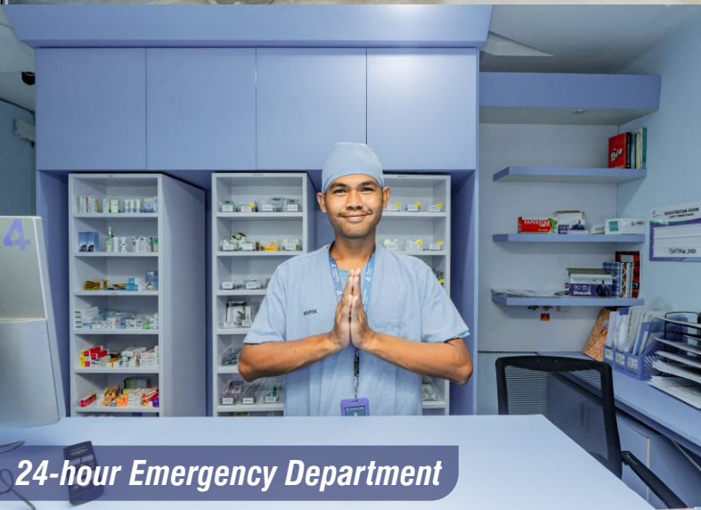
24-hour Emergency Department

EMAIL : ✉ GILIAIRCLINIC@GMAIL.COM 4PILLARASSIST@GMAIL.COM