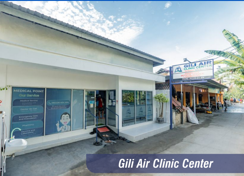
Gili Air Clinic Center

THE MEDICAL CENTER FACILITY THAT WE HAVE IN GILI AIR IS CALLED THE GILI AIR CLINIC CENTER